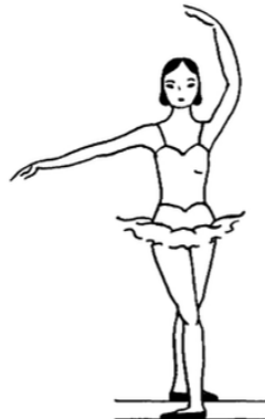
Fourth position en haut of the arms (with the feet in the fourth position croisée).