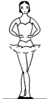
Fifth position en avant of the arms (with the feet in the fifth position).