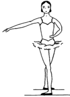
Fourth position en avant of the arms (with the feet in the fourth position croisée).