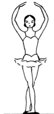
Fifth position en haut of the arms (with the feet in the fifth position).