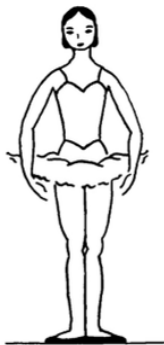
First position of the arms (and feet).

Carriage of the arms. A movement or series of movements made by passing the arm or arms through various positions. The passage of the arms from one position to another constitutes a port de bras. In the execution of port de bras the arms should move from the shoulder and not from the elbow and the movement should be smooth and flowing. The arms should be softly rounded so that the points of the elbows are imperceptible and the hands must be simple, graceful, and never flowery.