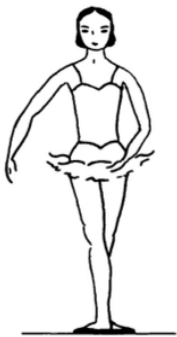
Third position of the arms (and feet).