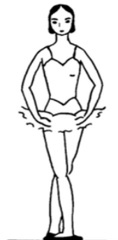
Fifth position en bas of the arms (with the feet in the fifth position).